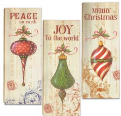
Large holiday signs from Abbott. SRP: $22 each

Everything old is new again at Accents de Ville. In their Rustic Charm collection, nostalgia leads the way with hand-knit sweater ornaments, toboggans, moose, skates and the like. Brown, red and beige are the collection’s main colours, while rustic felt, bark, fur and knits are the materials of choice.