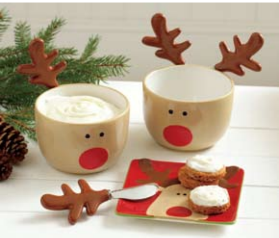
Top left: Genuine Monkeez collection from Midwest-CBK. Opposite left: Merry Moose dip bowl and spreader set from Tag through Candym Enterprises. SRP: $21 Right: Pearl white snowman ornaments from Abbott. SRP: $3.50 each

In another of Accents de Ville’s collections, Holiday Revival, “fun, vintage and happy” are the keywords on the design board. Everything from recycled bottlecap and vintage toy ornaments to graphic vintage prints are contrasted with a modern colour combo of bright lime green and eye-popping red.