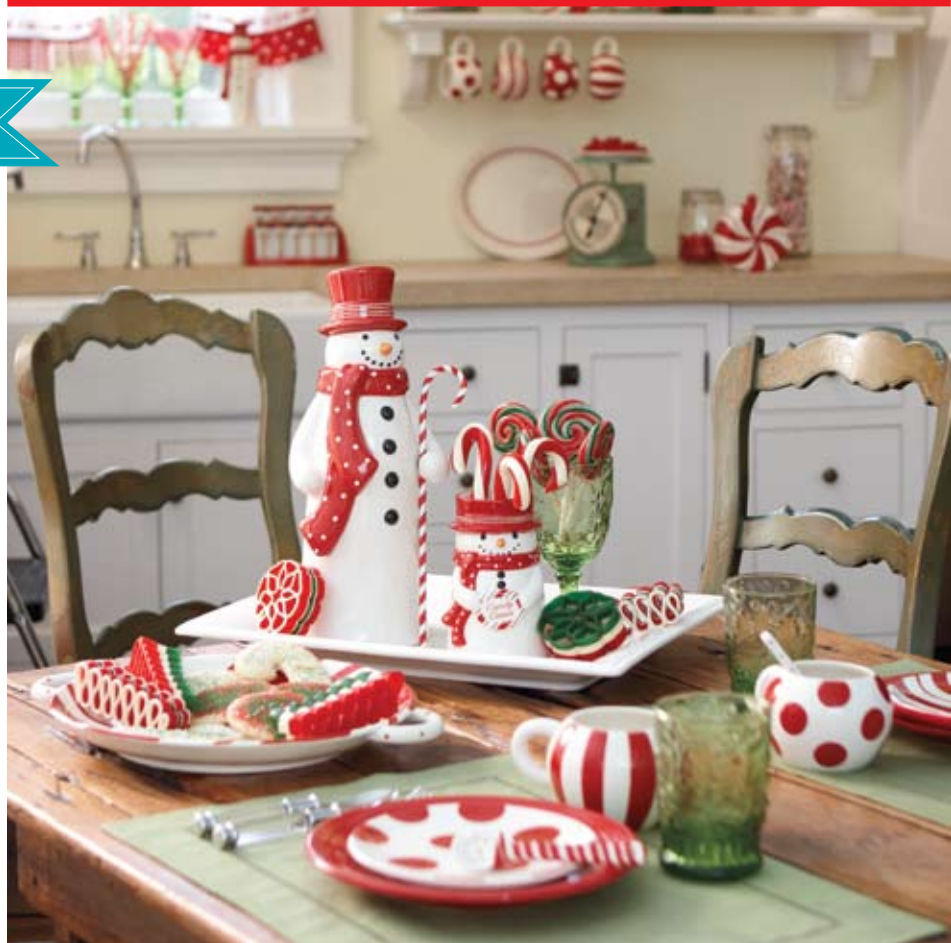
Above: The Peppermint Twist collection from Midwest-CBK.

Hand-crafted, natural products continue to trend up in the market. “As we face high-tech gadgets and gizmos every day, there’s an opposite, counter trend underfoot in design,” says Coe-Stephan. “Consumers are looking for natural, eco-friendly products that have an artisan, hand-crafted feel and quality to them, reminding us that people are behind the designs.” Eco-friendly materials like organic, hand-dyed wools and yarns feature prominently in their Warm and Fuzzy Collection. “The stockings, ornaments, booties and tote bags in this collection are handmade of felted wool in cheerful colours like red, green and turquoise. The unique cottage industry process for making these pieces gives each one a unique artisan-crafted feel.”