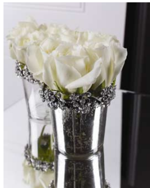
Antique silver votive with gem band from Abbott. SRP: $15 each