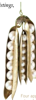
Pea in a pod ornaments from Accent Imports. SRP: Set of four $10