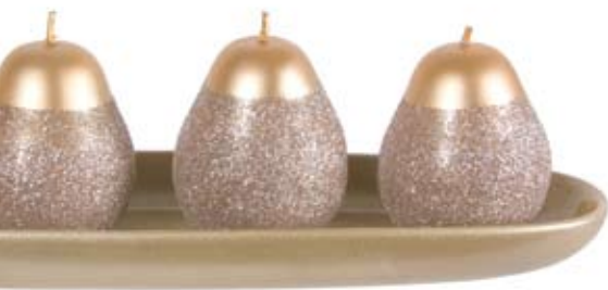
Four pear candles on a tray from Samaco Trading. SRP: $25

All prices are suggested retail. Please turn to Supplier Listings, starting on page 86, for company contact information.