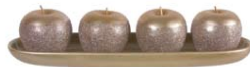
Four apple candles on a tray from Samaco Trading. SRP: $23